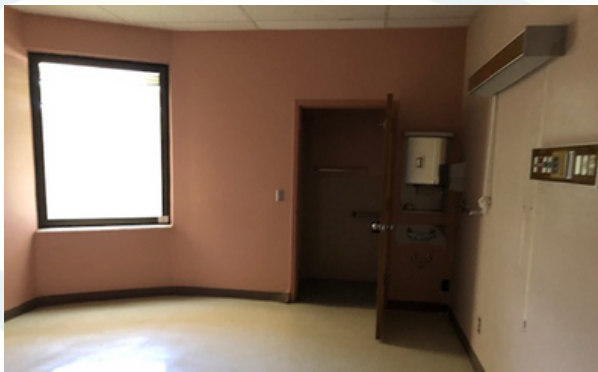
Patient Room Before

Meridian executed the plan to repair the deferred capital projects and separate tenant entrances on time and on budget, all while keeping the building operational. To mitigate potential delays during the global supply-chain crisis, we teamed with DPR and GLHN to procure progressive Guaranteed Maximum Price (GMP) contracts for design and construction. Meridian also engaged an energy consultant to measure existing facility system controls, evaluate options to reduce energy consumption, review central plant equipment, and set facility control optimization to reduce energy and maintenance costs. This resulted in major operating savings for our end users and achieved our sustainability goals. Both anchor tenants have since expanded and are extremely happy with how the building now operates.